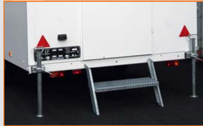
adjustable galvanized prop stands