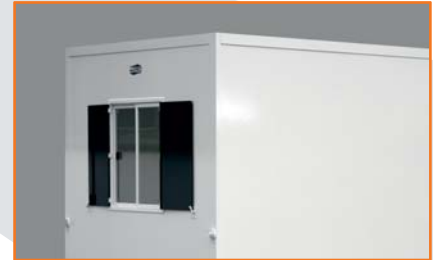
sliding window with window shutters