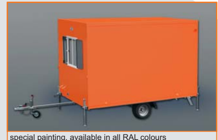
special painting, available in all RAL colours