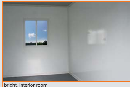
bright, interior room