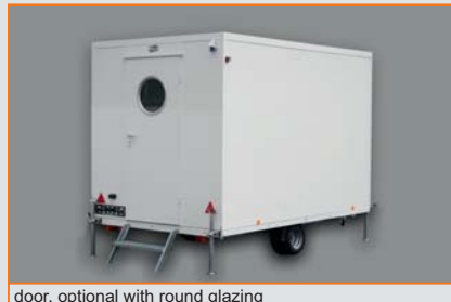
door, optional with round glazing