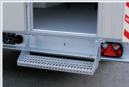
solid galvanized stair , 1-step