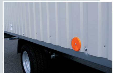
Floor made from one piece sandwich element with subfloor made from galvanized steel , galvanized floor frame