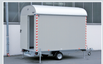
RASANT BME-B 20 S

Site Welfare Trailer, single axle, with ball hitch , body length of 3.20 m , with galvanised chassis , unbraked, 80 km/h speed, permissible total weight 750 kg