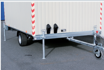
pr chassis made from galvanized lightweight profiles , galvanized prop stands