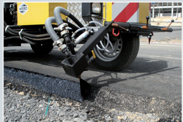
Sealing of longitudinal joints and edge with the lateral nozzle head.