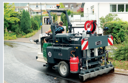
TM 800 SH

Self-propelled bitumen sprayer on extremely manoeuvrable 3-wheel chassis for the reliable and accurate application of all kinds of cold-liquid tack coating materials and bitumen emulsions, including polymer modified binders